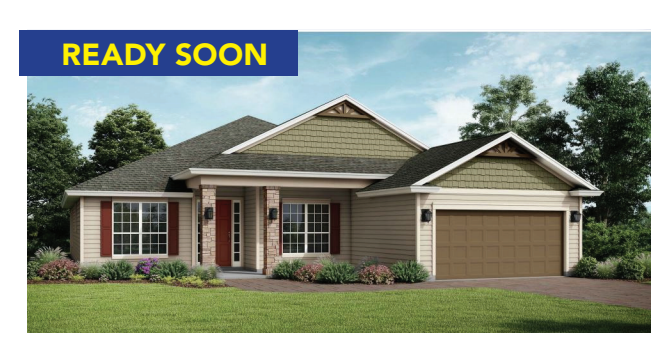
CARROLLVIEW C - LOT 115

Address: 56 Suzanne Lake Dr., St. Augustine, FL 32095