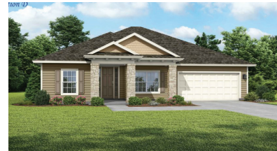
WATERMAN D - LOT 122

1611 Linda Lakes Lane, Middleburg, FL 32068