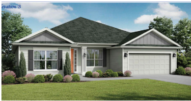
PALAZZO B - LOT 120

Don't miss your final chance to buy new in the gated community of Linda Lakes. This serene community features a community pool, playground, pooch park, multi-use field and lighted lakefront cabanas for your enjoyment with your family and friends.