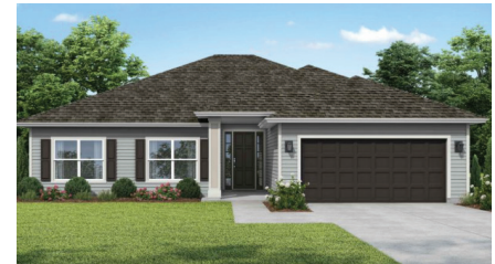
GREENWOOD A - LOT 6

6284 Weston Woods Drive, Jacksonville, 32222