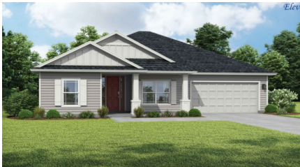
WATERMAN C - LOT 4

Weston Woods is a new single-family community located on Sandler Road in Duval County, Florida. This quaint new home community features 39 beautiful homesites and is very private with only one entrance. Its location provides a serene escape yet offers easy access to the major Jacksonville corridors of I-295, I-10, I-95 and Cecil Commerce Center Parkway.