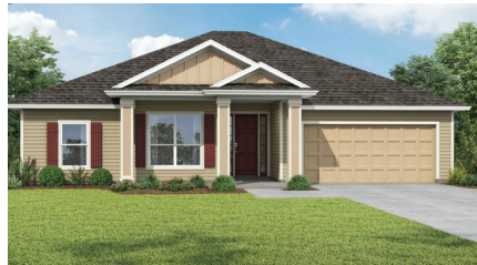
WILLOW WOOD B - LOT 5

6290 Weston Woods Drive, Jacksonville, 32222